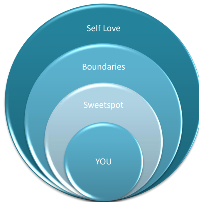
Figure 1.0 Sources of love, energy & fulfillment in life

Our moods are more consistent because WE are providing the energy, love & acceptance that we require. Even during challenging days/weeks, we are able to recognize and provide the nurturing and self love that we need. We move out of relying on others as our (inconsistent) source of love and move into relying on ourselves as our own consistent, reliable, constant source of love.